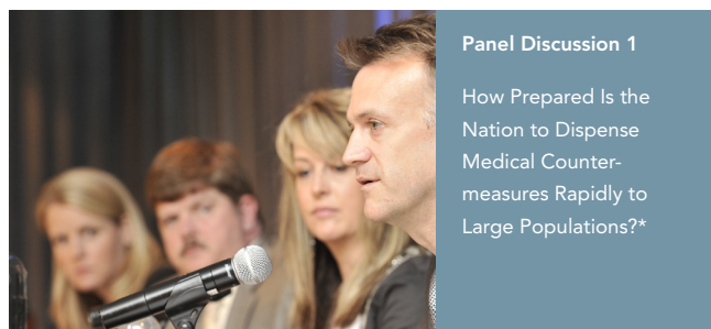
Panel Discussion 1 How Prepared Is the Nation to Dispense Medical Counter- measures Rapidly to Large Populations?*

Secretary Sebelius underscored the need to strengthen the nation's public health infrastructure, which undergirds U.S. response to disasters. She made reference to a recent CDC report on performance of the Public Health Emergency Preparedness cooperative agreement program, which demonstrated that the economic downturn and reductions in preparedness funding may be hindering gains in preparedness at the state and local levels.