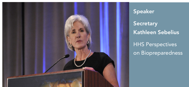
Speaker Secretary Kathleen Sebelius HHS Perspectives on Biopreparedness

Fortunately, with a greater understanding of the threat posed by biological agents, leaders in the U.S. government and in the private sector are working to build national response capacity and resilience.