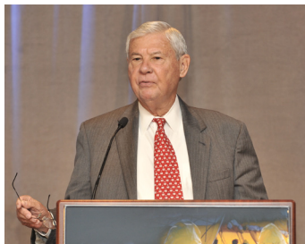
Speaker Senator Robert Graham Senator Bob Graham, Chairman, WMD Commission; Co-Founder, The WMD Center

Senator Graham characterized the chain of resilience at the recent Center for Biosecurity conference, “The State of Biopreparedness: Lessons from Leaders, Proposals for Progress” (Washington, DC; September 23, 2010). The Center convened this national meeting to provide a forum for thought leaders from the public and private sectors to discuss ongoing challenges and priorities in biopreparedness and identify opportunities for improvement. Highlights are offered below; full conference proceedings can be found at www.upmc-biosecurity.org/biopreparedness .